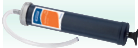
5 A5/L 500cc Oil Suction Gun

For use on vehicles and machinery such as gearboxes, axles, etc. Supplied complete with flexible delivery tube 10mm bore. Display carton.