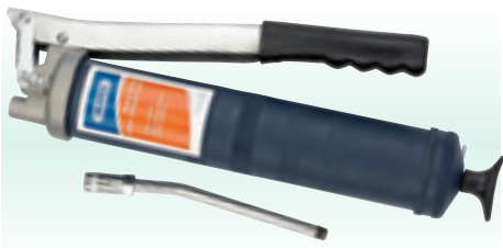
2 A4/L 500cc Heavy Duty Lever Grease Gun

For bulk loading with stiff, medium or heavy grease for agricultural, automotive or industrial applications. Heavy duty spring, plunger assembly and air release valve. Complete with delivery tube and hydraulic connector. Side lever action. Suitable for cartridge, suction and bulk loading. Safe working pressure 62Mpa (9000 psi). Threaded 1/8" BSPT. Display carton.