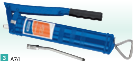
3 A7/L 500cc Grease Gun

Lever action gun for use with standard grease gun cartridges and bulk. Supplied complete with delivery tube, connector with 1/8" BSPT thread and pressure relief valve. Safe working pressure 55MPa (8000psi). Display carton.