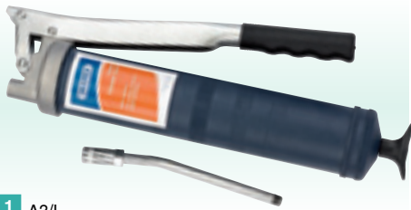
1 A3/L 500cc Lever Grease Gun

Heavy duty spring and plunger assembly, complete with delivery tube and hydraulic connector. Side lever action. Suitable for grease cartridge loading. Safe working pressure 40MPa (6000 psi). Threaded 1/8" BSPT. Display carton.