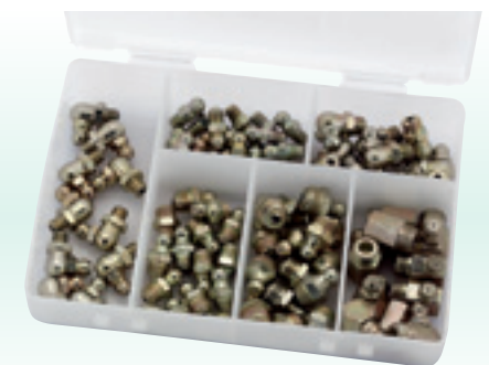
10 GNA-BSPT 50 Assorted BSPT Grease Nipples

Manufactured from EN-1A steel with profiles to BS, SAE, DIN, JIS and IS. Heat treated to SAE J534 and hardened. Yellow zinc plated to ASTM B117 specification. Display packed in plastic storage case.