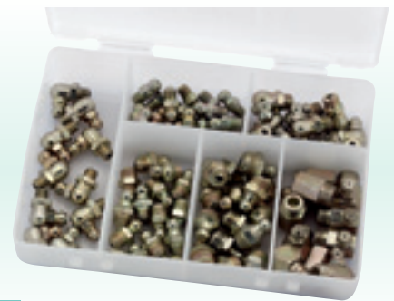
9 GNA-M 70 Assorted Metric Grease Nipples

Manufactured from EN-1A steel with profiles to BS, SAE, DIN, JIS and IS. Heat treated to SAE J534 and hardened. Yellow zinc plated to ASTM B117 specification. Display packed in plastic storage case.