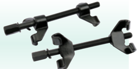
9 N145 2 piece Coil Spring Compressor Set

Forged carbon steel claws hardened and tempered. M16x1.5mm screw manufactured from carbon steel hardened, tempered with a chemically blacked finish. Capacity 90-200mm. Carton packed.