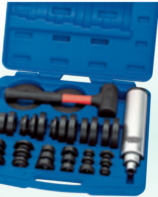
1 BSD/SET37 37 piece Bearing Positioning Kit

Expert Quality , for the positioning of bearings without damage to the bearing or bearing cage. Lightweight and portable, ideal for use on location when servicing vehicles/machinery. Comprises dead blow hammer, three drift sleeves and 33 different-sized drifts to match individual bearings. Packed in blow mould case with display sleeve. Contents: