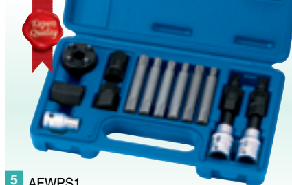
5 AFWPS1 13 piece Alternator Pulley Tool Kit

Expert Quality , for the removal of alternators and freewheel pulleys either on or off the engine on popular European car marques. Packed in blow mould case with display sleeve. Contents: