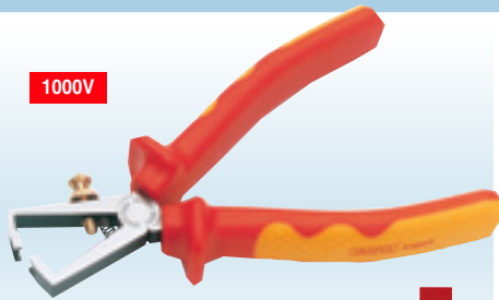
1 79AVDE 150mm VDE Approved Fully Insulated Wire Stripping Pliers

Manufactured to DIN Standard and individually certified to EN 60900:2004 Expert Quality , drop forged from chrome vanadium steel correctly hardened and tempered with additionally induction hardened cutting edges. Each plier has been tested to 10,000V for safe 1000V AC or 1500V DC live line working. Lacquered finish for corrosion protection with heavy duty, fully insulated, soft grip handles with slip guards. Display packed.