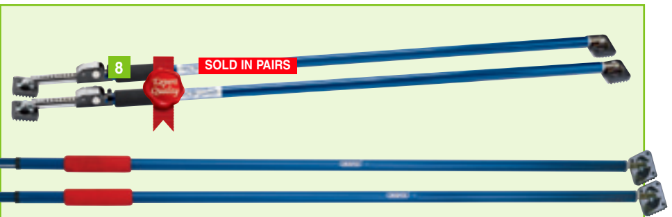
8 QS/2 Pair of 'Quick Action' Telescopic Rods

Expert Quality , ideal when fixing or assembling door frames, window frames, architraves etc. Two section heavy duty tubular construction incorporating a 'quick action' ratchet mechanism and sliding lock pin. Minimum rod length 1.45M, maximum rod length 2.5M. The large swivel foot (80 x 60mm) gives good stability. Maximum weight capacity at 90° (vertical) - 50kg and at 45° - 20kg. A larger swivel foot (350 x 60mm) which gives additional support is available. Display carton.