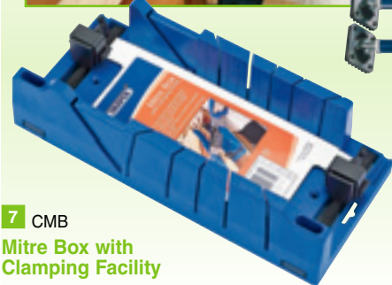
7 CMB Mitre Box with Clamping Facility

Moulded from tough high quality plastic to give exceptional rigidity. Two sprung clamps for holding workpiece. Two 45°, two 22.5° and one 90° guides on the two edges with a side on 45° for larger sections of materials. Two bench edge stops on the underside to prevent movement whilst working. The base has two countersunk slots for permanent fixing to bench. Sold loose.