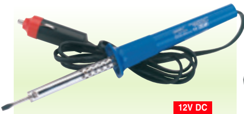
3 SI15/12VA 12V DC 15W Soldering Iron

Soldering iron with car cigarette lighter plug and 1.2M of cable. Supplied complete with straight tip. An ideal tool for use in vehicles and by model makers. Display packed.