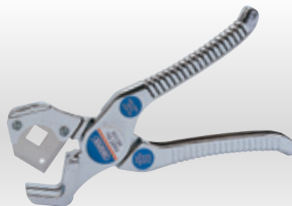
6 HC102 6-25mm Rubber Hose and Pipe Cutter

Plier-action cutter with diecast zinc alloy body. Fitted with reversible hardened and tempered replaceable steel blade. Length 190mm. Display packed.