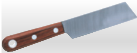
2 D7 Hacking (or Lead) Knife

Heavy polished steel blade with broad striking back and cutting edge. Handle which is securely fixed with two rivets to the full length blade tang. Display packed.