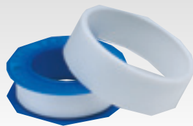
3 TP-PTFE 12M Plumbers PTFE Tape

For water plumbing applications. In plastic reel with dust cover. Shrink wrapped in singles with label.