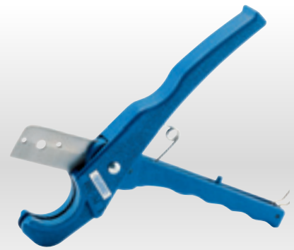
7 PC38 36mm Rubber Pipe Cutter

Ideal for cutting flexible hoses and soft rubber tubing from 0-36mm diameter. Cast aluminium body with hardened and tempered carbon steel blade and handle clip. Display packed.