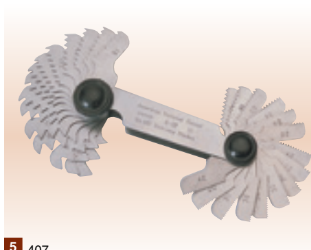
5 407 30 Blade UNC-UNF Screwpitch Gauge Set

Folding leaves, individually stamped with accurately formed thread profiles. American National Thread UNC-UNF, in the range 4-42TPI. Sold loose.