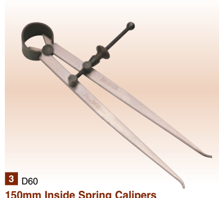
3 D60 150mm Inside Spring Calipers

Fine ground with adjustment by knurled wheel. Display packed.