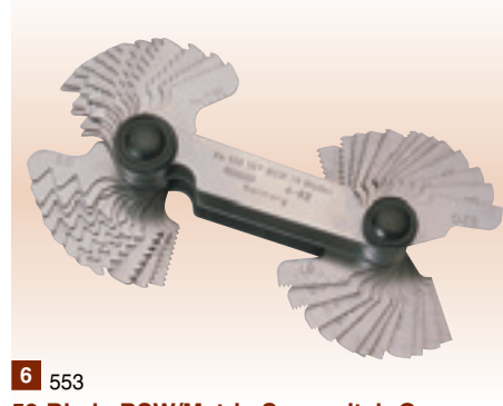
6 553 52 Blade BSW/Metric Screwpitch Gauge Set

Folding leaves, individually stamped with accurately formed thread profiles. Ranges 4-62BSW and 0.25-6.0mm. Sold loose.