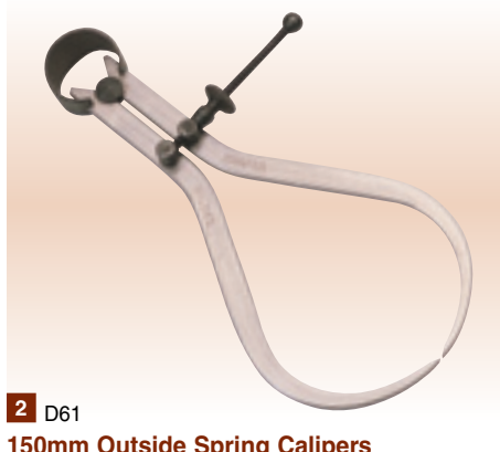
2 D61 150mm Outside Spring Calipers

Fine ground with adjustment by knurled wheel. Display packed.