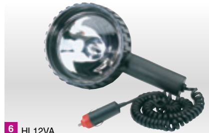
6 HL12VA 500,000 Candle Power 12V DC Halogen Lamp

Halogen spotlight with 110mm diameter lens for general applications in and around the car, boat and caravan etc. Supplied with 1M (unstretched) of flexible cable and vehicle cigarette lighter-type plug. Can be used with Draper Power Pack Stock No. 54723. Display carton.