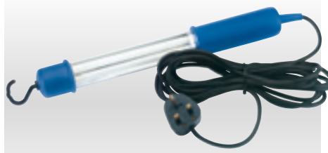
2 576HLB 11W 230V Fluorescent Inspection Lamp

Manufactured to IP20 Specifications Single fluorescent "U" lamp with useful hang-up hook. 5M (approx.) cable and approved plug (13A). Spare tubes available. Display carton.