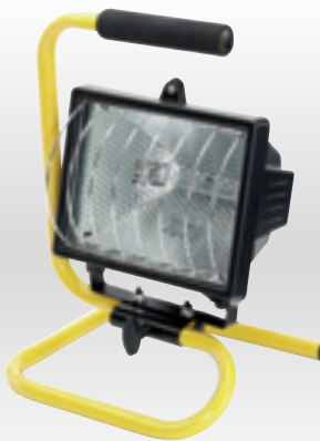
8 HL400FC 400W 230V Halogen Worklamp

Manufactured to IP54 Specifications Two-piece frame construction with tilt and lock facility. Manufactured to IP54 Specifications suitable for external use. Supplied with halogen bulb and fitted with a metal grille to protect lens/bulb from damage and protect users hands from hot lens. 1.8M (approx.) cable and approved plug. Display carton.