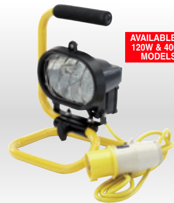
9 110V Halogen Worklamps

Manufactured to IP54 Specifications Two-piece frame construction with tilt and lock facility. Manufactured to IP54 Specifications suitable for external use. Supplied with halogen bulb and fitted with a metal grille to protect lens/bulb from damage and protect users hands from hot lens. Supplied with 1.8M (approx.) of cable and plug. Display carton.