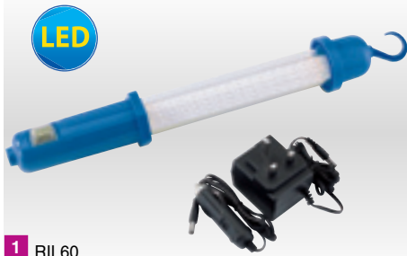
1 RIL60 Rechargeable 60 LED Inspection Lamp

Heavy duty plastic with useful hang up hook. Gives up to five hours continuous working time between charges. Maximum charging time three hours. Supplied with BS approved 3 pin 230V charger and a 12V DC charger with vehicle cigarette lighter plug. Display packed.