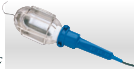
5 574A 230V Inspection Lamp

Incorporates a reflective head, useful hang up hook and protective cage around bulb. Maximum bulb size 60W Edison screw (not supplied). Supplied with 6M (approx.) cable and approved plug. Display carton. The bulb used in this lamp MUST not exceed 60W.