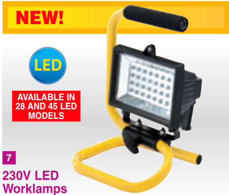
7 230V LED Worklamps

Manufactured to IP54 Specifications Two-piece frame construction with tilt and lock facility. Manufactured to IP54 Specifications suitable for external use. 1.8M (approx.) cable and approved plug. Display carton.