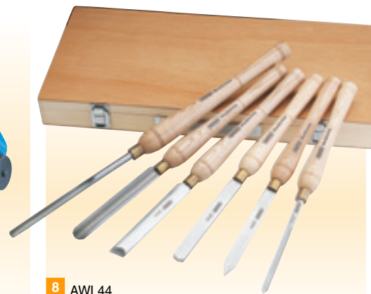
8 AWL44 6 piece HSS Woodturning Chisel Set

Hardened blades with brass ferrules. Ash handles. Packed in wooden storage box. Contents: • Bowl Gouge with 12.7mm (1/2") blade • Roughing Gouge with 25mm (1") blade • Oval Skew with 25mm (1") blade • Parting Tool with 5.5mm (7/32") blade • Round Nose Scraper with 25mm (1") blade • Spindle Gouge with 10mm (3/8") blade