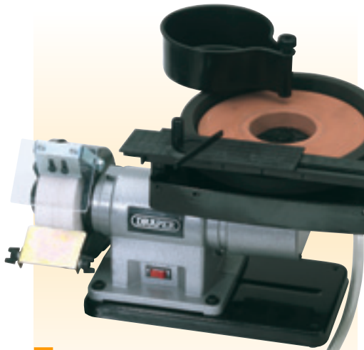
4 GWD205A 350W 230V Wet & Dry Bench Grinder

Designed for the workshop to hone and grind hand and garden tools. With a horizontal whetstone honing wheel, dry white grinding wheel, eye protection shield, spark deflectors, wheel guards and adjustable tool rests. Uses white dry grinding wheel especially suitable for high speed steel tooling. Fitted with a BS approved non-rewireable 3 pin moulded plug and cable. Display carton.