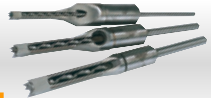
5 Mortice Chisels with Bits

Manufactured from high carbon steel hardened and tempered, finely ground, polished with honed cutting edges. Display packed.