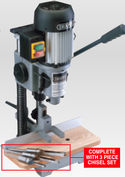
COMPLETE WITH 3 PIECE CHISEL SET