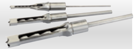
4 245 Hollow Square Mortice Chisels with Bits

Expert Quality , manufactured from high carbon steel hardened and tempered. Chisels are finely ground and polished with honed cutting edges. Chisel shank diameter 13/16" (Stock No. 48080 is 1.3/16"). Display packed.