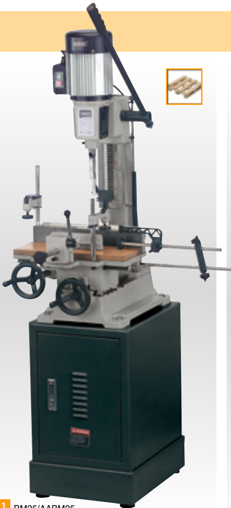
1 BM25/AABM25 1" 750W 230V Bench Morticer & Stand