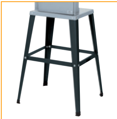
Stock No. 76251