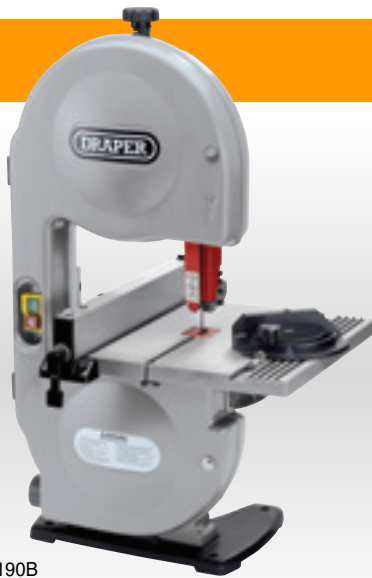
1 BS190B 190mm 350W 230V Two Wheel Bandsaw