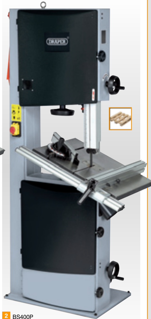
2 BS400P 400mm 2200W 230V Professional Two Wheel Bandsaw