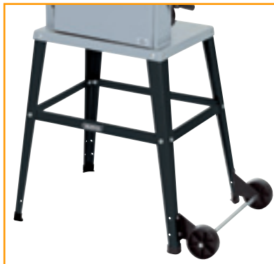
Stock Nos. 76252 (Stand) 76256 (Wheel Kit)