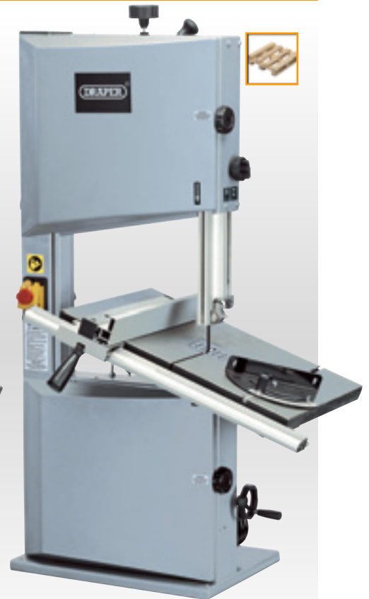
3 BS350C 350mm 1100W 230V Two Wheel Bandsaw