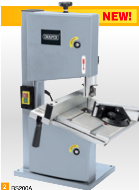
2 BS200A 200mm 250W 230V Two Wheel Bandsaw