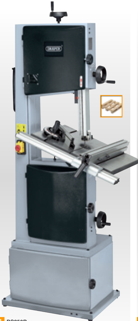
1 BS350P 350mm 1500W Professional Two Wheel Bandsaw