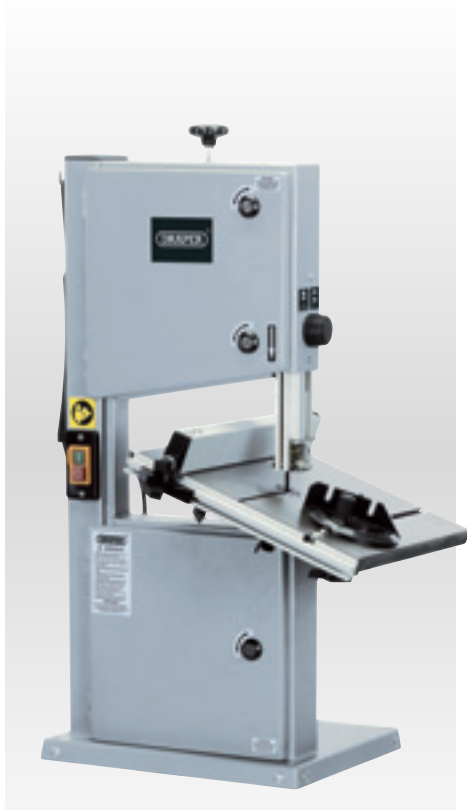
1 BS250A 250mm 370W 230V Two Wheel Bandsaw