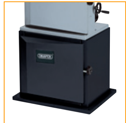
Stock No. 76253