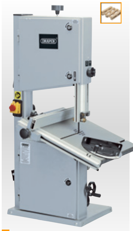
2 BS315 315mm 740W 230V Two Wheel Bandsaw