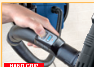
HAND GRIP WITH REMOTE ON/OFF CONTROL AND 7M OF HOSE