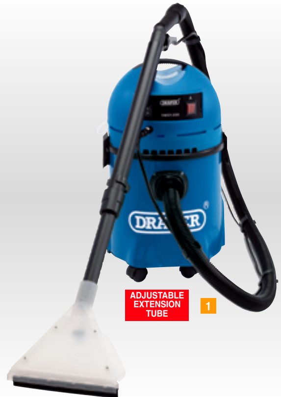
ADJUSTABLE EXTENSION TUBE