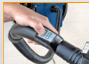
HAND GRIP WITH REMOTE ON/OFF CONTROL AND 7M OF HOSE