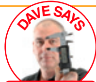
QUALITY MAKES THE DIFFERENCE

Also, it boasts an unusual wall mounting feature, allowing it to be stowed easily away in workshops or garages.