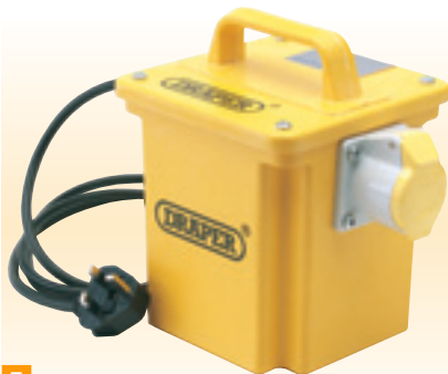
7 DPT1000/1 1kVA 230V Portable Site Transformer

STOCKIST INFORMATION REVISED CODES APPLY TO ITEM NOS. 7, 8 & 9 ONLY ON THIS PAGE