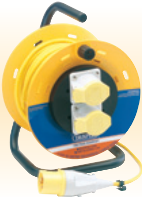
4 DCR25/110A 25M 110V AC Industrial Cable Reel

Complies with BS5733, BS1363 and BS6500 Specifications. BSI Approved.