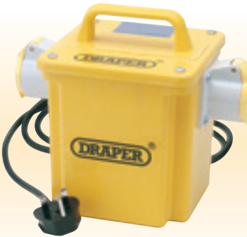
8 DPT1500/2 1.5kVA 230V Portable Site Transformer