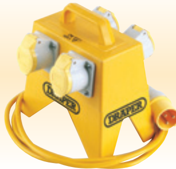
5 EL4 4 Way Junction Box for 110V Site Transformer

For use with Draper 110V Portable Site Transformers and other manufacturers similar transformers. Allows up to four tools to be powered off one transformer. Four 16A sockets and 16A plug to BS4343 with 3M of 2.5mm 2 arctic cable. Carton packed.