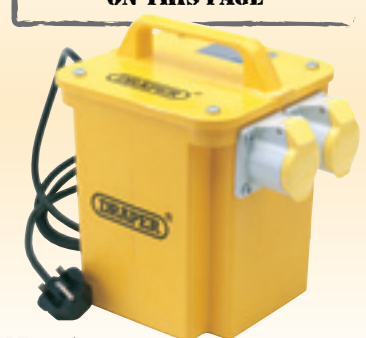
9 DPT3300/2 3.3kVA 230V Portable Site Transformer

Complies to BS3535, EN60742: 1996 and IP44