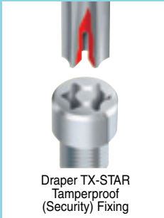
Draper TX-STAR Tamperproof (Security) Fixing

COMPATIBILITY OF "DRAPER TX-STAR" AND TORX† - The "Draper TX-STAR" profile is totally compatible with the Torx† fixing system. Users of "Draper TX-STAR" products need have no fear concerning compatibility. All "Draper TX-STAR" products have been thoroughly tested as to their compatibility.