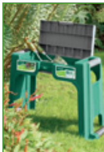
COMPARTMENT UNDER SEAT TO STORE HAND TOOLS