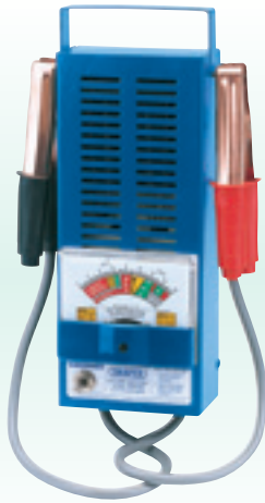
1 BLT100 100A Battery Load Tester

Suitable for testing 6 and 12V lead acid batteries, charging and starting circuits found on most motorcycles, cars, light commercial vehicles, tractors, boats etc. Tests: state of charge, cranking ability, charging system output and starter motor. Tests up to 100A. Display carton.