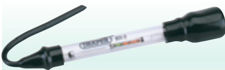
3 BH-2 Battery Hydrometer

For testing density of battery electrolyte. With glass tube, PVC bulb and spout. Sold in plastic display tube.