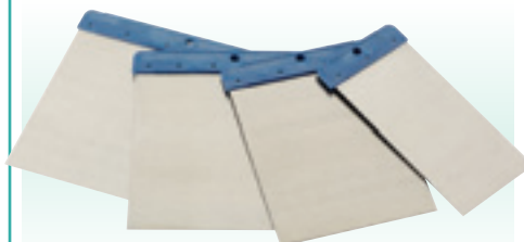
5 BFAS 4 piece Body Filler Applicator Set

Sprung steel with plastic header grips. Ideal for use on vehicles and around the home. Display packed.