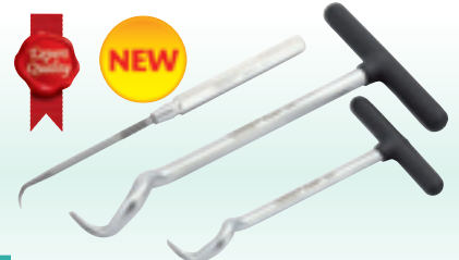
7 OSP3 3 piece O-Ring and Seal Puller Kit

Expert Quality , for use in the automotive or engineering workshop. Satin chrome plated shafts. Display packed.