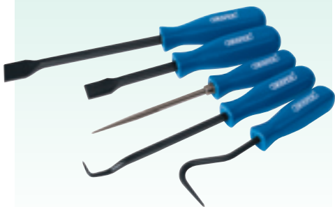
3 5SR SET 5 piece Scraper and Remover Set

Suitable for a variety of applications including removing cotter pins, radiator hoses, flaking paint and gaskets. Blades hardened and tempered carbon steel. Display packed.