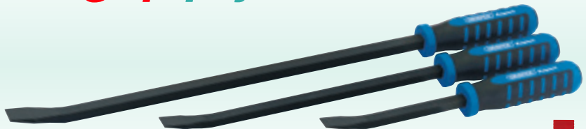
8 PB/SET/SG3 3 piece Soft Grip Pry Bar Set

Expert Quality , chemically blacked finish blades with striking caps and impact-resistant soft grip handles. Display packed. Contents: 300, 450 and 600mm long