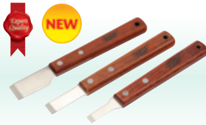
4 SSS3 3 piece Stainless Steel Scraper Set

Expert Quality , 1.5mm thick stainless steel blades with lacquered wood handles. Display packed in wallet.