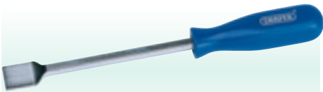
2 178A Gasket Scraper

Manufactured from carbon steel hardened, tempered and satin chrome finish with shot blast scraper end. For cleaning cylinder heads, removing old sealants and carbon, etc. Display packed.