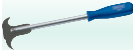
6 ORP2 O Ring and Seal Puller

Universal seal puller for use on rubber 'O' rings, oil and grease seals. Particularly useful on commercial vehicle applications. Display packed.