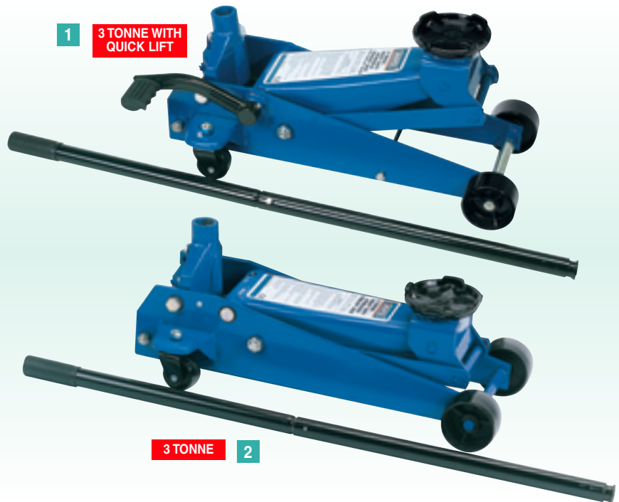
3 TONNE 2