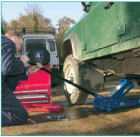
1 3 TONNE WITH QUICK LIFT