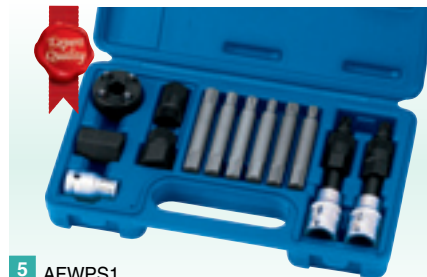
5 AFWPS1 13 piece Alternator Pulley Tool Kit

Expert Quality , for the removal of alternators and freewheel pulleys either on or off the engine on popular European car marques. Packed in blow mould case with display sleeve. Contents: