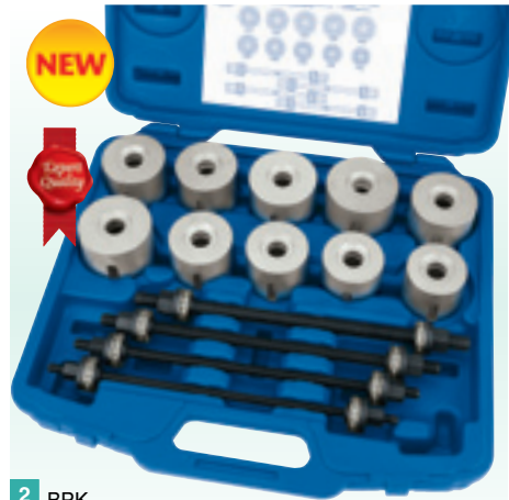
2 BPK Bearing, Seal and Bush Insertion/Extraction Kit

Expert Quality , for the accurate and controlled insertion/removal of normal bearings, silent bearings, hydraulic bearings, rubber bearings, bearing bushes, shaft seals etc. Comprises 20 adaptor rings and four fine thread puller bars with hex. nut ends. Packed in blow mould carrying case and display sleeve.