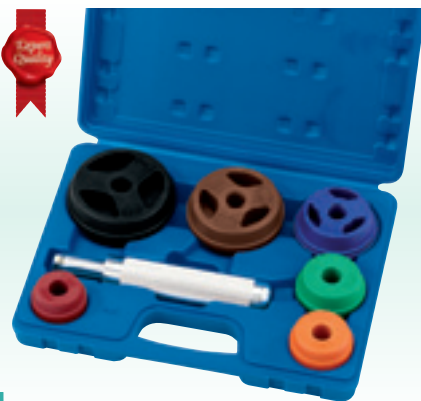
4 BSD/SET7 7 piece Bearing Positioning Kit

Expert Quality , for the positioning of bearings without damage to the bearing or bearing cage. Comprises driver bar and six different-sized composite press blocks to match individual bearings. Packed in blow mould case with display sleeve. Contents: