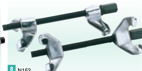
8 N152 2 piece Coil Spring Compressor Set

Wrap round claws with polished chrome finish. Lead screw manufactured from carbon steel hardened and tempered. Jaw design makes them suitable for use in confined areas. Maximum opening 220mm. Display carton.