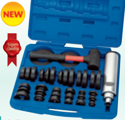
1 BSD/SET37 37 piece Bearing Positioning Kit

Expert Quality , for the positioning of bearings without damage to the bearing or bearing cage. Lightweight and portable, ideal for use on location when servicing vehicles/machinery. Comprises dead blow hammer, three drift sleeves and 33 different-sized drifts to match individual bearings. Packed in blow mould case with display sleeve. Contents: