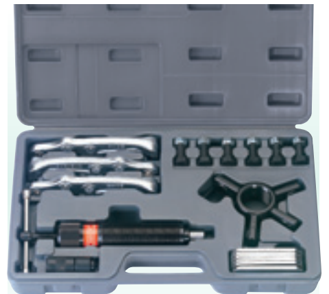
6 HPK 10 Tonne Hydraulic Puller Kit

Six position multi-function puller with adjustable two or three leg function. Allows bearings, gears, etc. to be removed with minimal effort by use of the hydraulic puller. Supplied complete with instruction manual. Packed in blow mould carrying case with display sleeve. Contents: