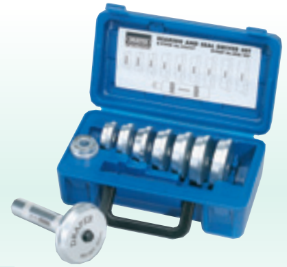
3 BSD/SET 10 piece Bearing and Seal Driver Set

For the installation of bearings and seals. Helps avoid damage to bearing and seal faces. Packed in blow mould case and display sleeve. Contents: