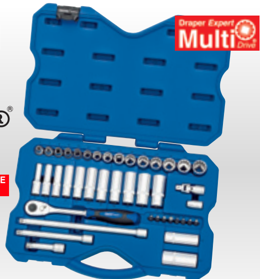
4 D42MDSN 42 piece 3/8" Sq. Dr. Metric 12 point Draper Expert Multi-Drive® Socket Set

Manufactured and tested generally in accordance with DIN3122 and ISO3315 Specifications