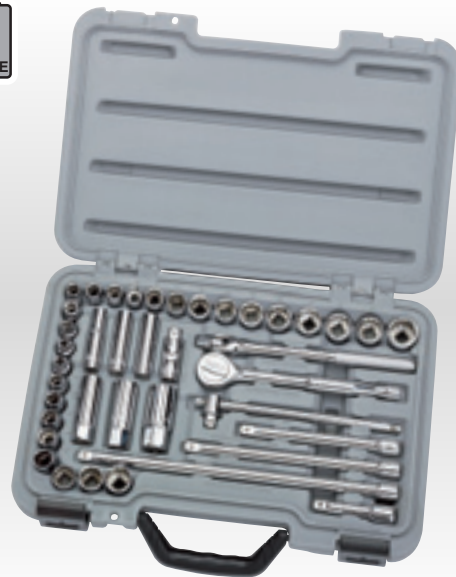
2 SD40AMN 40 piece 3/8" Sq. Dr. MM/AF Combined Socket Set

Silverdrive® socket set, manufactured from chrome vanadium steel hardened, tempered and chrome plated for corrosion protection. Packed in blow mould carrying case and display sleeve.