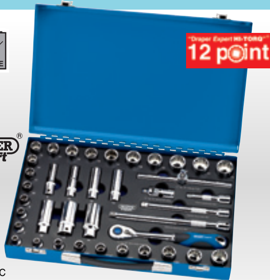
1 D39AM/MC 39 piece 3/8" Sq. Dr. MM/AF Combined Socket Set in Metal Case

Manufactured and tested generally in accordance with DIN3122 and ISO3315 Specifications Expert Quality , manufactured from chrome vanadium steel hardened, tempered, chrome plated and polished for corrosion protection. Sockets have knurled ring for extra grip. Packed in steel carrying case with laser cut foam insert and display sleeve. Contents: