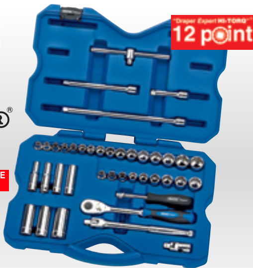
3 D40AMN 40 piece 3/8" Sq. Dr. MM/AF Combined Socket Set

Manufactured and tested generally in accordance with DIN3122 and ISO3315 Specifications Expert Quality , chrome vanadium steel hardened, tempered, chrome plated and polished for corrosion protection. Features a low profile 60 tooth reversible ratchet. Packed in blow mould carrying case and display sleeve.