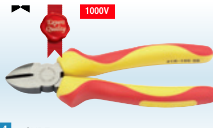
4 41SVDE VDE Approved Fully Insulated Slimline Diagonal Side Cutters

Manufactured to DIN Standard and individually certified to EN 60900:2004 Expert Quality , drop forged from chrome vanadium steel correctly hardened and tempered with additionally induction hardened cutting edges. Each plier has been tested to 10,000V for safe 1000V AC or 1500V DC live line working. Lacquered finish for corrosion protection with heavy duty, fully insulated, soft grip handles with slip guards. Display packed.