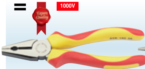
1 63SVDE VDE Approved Fully Insulated Slimline Combination Pliers

When working on electrical installations, it is safest to disconnect these systems from the energy supply first. Only a skilled and qualified electrician may work on live installations and then only in conformance with the relevant industrial safety standards.