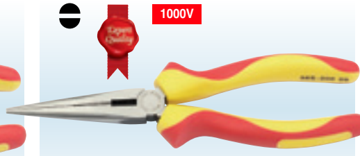
3 36SVDE VDE Approved Fully Insulated Slimline Long Nose Pliers

Manufactured to DIN Standard and individually certified to EN 60900:2004 Expert Quality , drop forged from chrome vanadium steel correctly hardened and tempered with additionally induction hardened cutting edges. Each plier has been tested to 10,000V for safe 1000V AC or 1500V DC live line working. Lacquered finish for corrosion protection with heavy duty, fully insulated, soft grip handles with slip guards. Display packed.