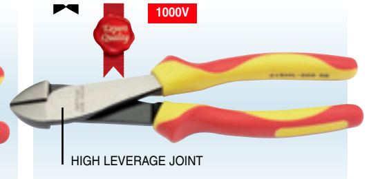
5 41SHLVE VDE Approved Fully Insulated High Leverage Slimline Diagonal Side Cutters

Manufactured to DIN Standard and individually certified to EN 60900:2004 Expert Quality , drop forged from chrome vanadium steel correctly hardened and tempered with additionally induction hardened cutting edges. Each plier has been tested to 10,000V for safe 1000V AC or 1500V DC live line working. Lacquered finish for corrosion protection with heavy duty, fully insulated, soft grip handles with slip guards. Display packed.