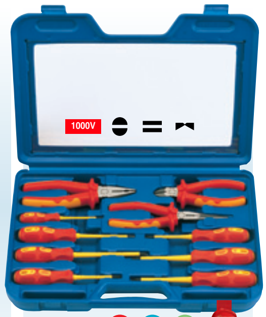
4 VDESET1 10 piece VDE Approved Fully Insulated Pliers and Screwdrivers Set

PZ TYPE screwdrivers are compatible with *Pozidriv®/Supadriv® fixing systems. *Pozidriv®/Supadriv® are registered trademarks of Trifast Plc.