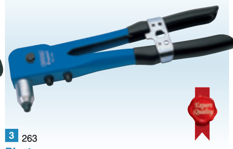
3 263 Riveter

Expert Quality , with body manufactured from carbon steel, hardened and tempered with jaws from chrome molybdenum steel. Supplied with three nozzles to accept 3.2, 4.0 and 4.8mm aluminium alloy and steel rivets. Steel handle clip acts as nozzle change wrench. Display packed. *Sold loose.