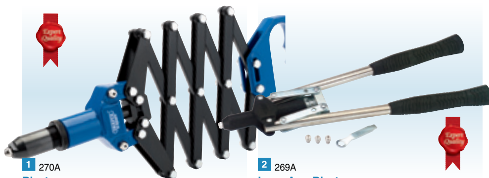
1 270A Riveter

Expert Quality , single pull action designed for fast repetitive applications. Heavy duty carbon steel lattice and head, shaped enamelled aluminium diecast grip and hardened chrome molybdenum jaws. Four nozzles to accept 2.4, 3.2, 4.0 and 4.8mm aluminium alloy, stainless steel and steel blind rivets. Display carton. *Sold loose.