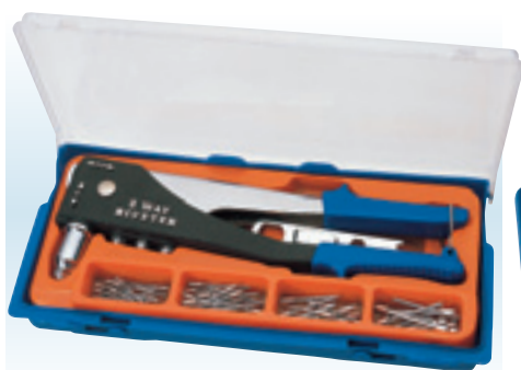
4 268AK Two Way Riveter Kit

General duty riveter with head that will operate at 90° or 180°. Chrome molybdenum jaws with four nozzles to accept 2.4, 3.2, 4.0 and 4.8mm aluminium alloy blind rivets. Supplied with approximately 60 assorted rivets, nozzle wrench and plastic carrying case. Display packed. *Sold loose.