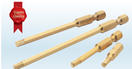
4 1/4" hex. Titanium Nitride Hexagonal E Shank Insert Bits

Expert Quality. S2 steel hardened, tempered with titanium nitride finish. Supplied in 1 or 2's. Display packed.