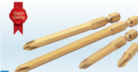
2 1/4" hex. Titanium Nitride Cross Slot E Shank Insert Bits

Expert Quality. S2 steel hardened, tempered with titanium nitride finish. Supplied in 1, 2, 5 or 10's. Display packed.