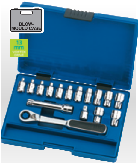
1 VTX16AM 16 piece 13mm Metric Draper Expert Vortex Gear-Ratchet Socket Set

Manufactured and tested generally in accordance with DIN3122 and ISO3315 Specifications Expert Quality , socket set manufactured from chrome vanadium steel hardened, tempered, chrome plated and polished for corrosion protection. The unique hollow socket technology of the Draper Expert VORTEX ratchet and sockets is ideal for long fixings. The sockets are edge driven. This allows a fixing to pass through the head and avoid the depth restriction of conventional sockets and ratchets. Packed in blow mould carrying case and display sleeve.