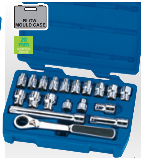
2 VTX20-19MM 19 piece 20mm Metric Draper Expert Vortex Gear-Ratchet Socket Set

Manufactured and tested generally in accordance with DIN3122 and ISO3315 Specifications Expert Quality , socket set manufactured from chrome vanadium steel hardened, tempered, chrome plated and polished for corrosion protection. The unique hollow socket technology of the Draper Expert VORTEX ratchet and sockets is ideal for long fixings. The sockets are edge driven. This allows a fixing to pass through the head and avoid the depth restriction of conventional sockets and ratchets. Packed in blow mould carrying case and display sleeve.