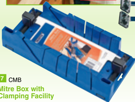
7 CMB Mitre Box with Clamping Facility

Moulded from tough high quality plastic to give exceptional rigidity. Two sprung clamps for holding workpiece. Two 45°, two 22.5° and one 90° guides on the two edges with a side on 45° for larger sections of materials. Two bench edge stops on the underside to prevent movement whilst working. The base has two countersunk slots for permanent fixing to bench. Sold loose.