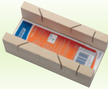
2 MB1/L Mitre Box

Beechwood with two 45° and one 90° guides on both edges. Sold loose.