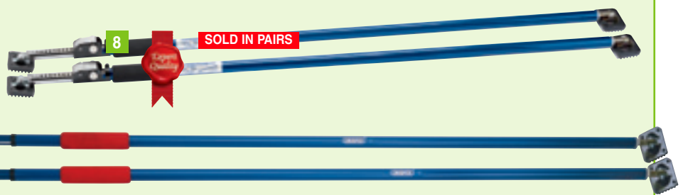
8 QS/2 Pair of 'Quick Action' Telescopic Rods

Expert Quality , ideal when fixing or assembling door frames, window frames, architraves etc. Two section heavy duty tubular construction incorporating a 'quick action' ratchet mechanism and sliding lock pin. Minimum rod length 1.45M, maximum rod length 2.5M. The large swivel foot (80 x 60mm) gives good stability. Maximum weight capacity at 90° (vertical) - 50kg and at 45° - 20kg. A larger swivel foot (350 x 60mm) which gives additional support is available. Display carton.