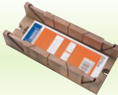
5 3614 Mitre Box

Moulded from tough high quality plastic to give exceptional rigidity. Two 45° and one 90° guides on the two edges with a side on 45° for larger sections of materials. The base has two countersunk slots for permanent fixing to bench. Sold loose.