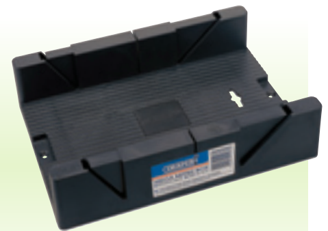
6 3618 Mega Mitre Box

General purpose box, moulded from tough impact resistant recycled plastic. One 45°, 60° and 90° guide on both edges. The base has two countersunk slots for fixing to bench. Ideal for the cutting of most sizes of coving, skirting boards etc. Sold loose.