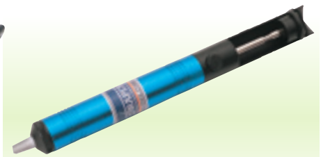
7 SCS Solder Sucker

For the removal of surplus molten solder during desoldering and soldering operations. The surplus molten solder is sucked into barrel of gun when button is pressed. Aluminium body. Display packed.