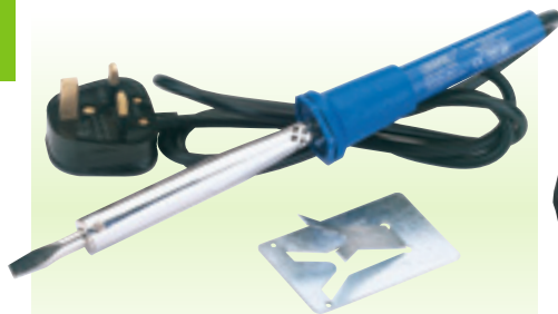
2 230V Soldering Irons

Manufactured to BS EN 60335-2-45 Specifications Regulations 1989 Soldering irons complete with tip and BS approved 3 pin plug and 1.2M (approx.) of cable. Display packed.