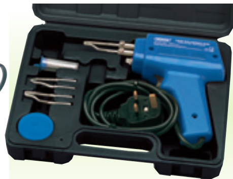
6 SG100 100W 230V Soldering Gun Kit

Comprising soldering gun with BS approved 3 pin plug (3A) and 1.2M (approx.) cable, two spare tips, tube of solder and flux. Packed in blow mould case with display sleeve.