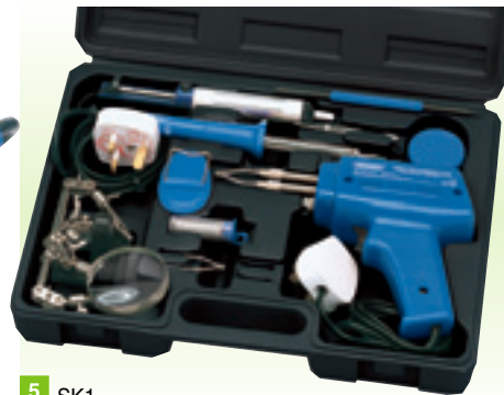
5 SK1 230V Soldering Kit

Manufactured to BS EN 60335-2-45 Specifications Comprising 30W soldering iron, 100W soldering gun both with BS approved 3 pin plug and 1.2M (approx.) cable, soldering tip, tube of solder, flux, solder sucker, tweezers, wireholder/pointer and workpiece clamp/magnifier. Packed in blow mould case with display sleeve.