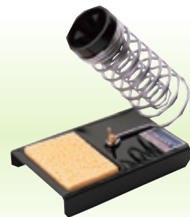
8 SIS Soldering Iron Stand

A quality stand with heavy duty metal base. Features a reinforced spring safety holder to prevent flex tangling with spring. Supplied complete with cleaning sponge. Display carton.