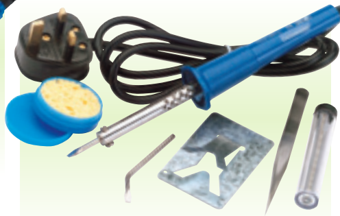
4 SI25K 25W 230V Soldering Kit

Manufactured to BS EN 60335-2-45 Specifications Comprising 25W soldering iron with BS approved 3 pin plug and 1.2M (approx.) cable, straight tip, tube of solder, bent tip, tweezers, stand and sponge. Display packed.