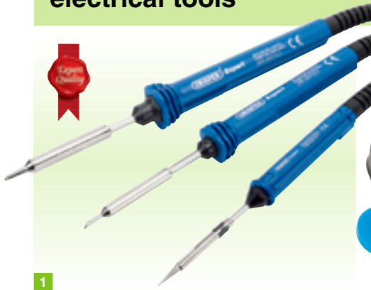
1 230V Professional Soldering Irons

Manufactured to BS EN 60335-2-45 Specifications Expert Quality , soldering iron complete with tip and BS approved 3 pin plug and 1.5M (approx.) of cable. Designed for continuous use in industrial environments. Display packed.