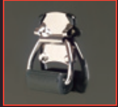
The tool chest features strong lifting handles with generous plastic grips.