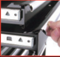
Drawers are fitted with positive latching catches that keep them firmly closed yet easily opened with the catch release handles.