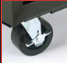
Two swivelling castors with locking facility.