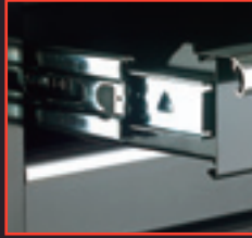
Every drawer has silky smooth ball bearing runners.