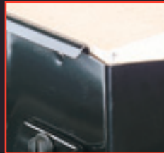
Heavy gauge sheet steel is used throughout with a tough oven baked powder coated finish.