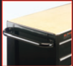
MDF board is used to protect the roller cabinet work surface.