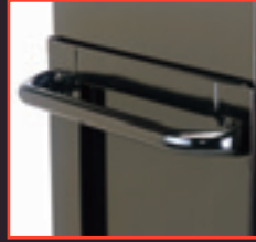
Roller cabinet has a comfortable tubular pull handle.