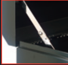
Robust maintenance free folding struts are used for simplicity and long life.