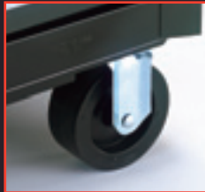
Large diameter and extra wide wheels.