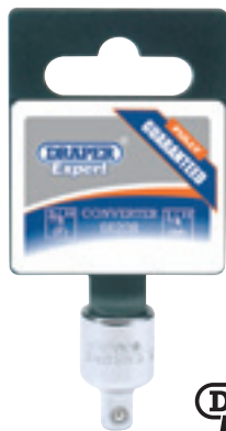
4 Socket Converters (display packed)

Manufactured and tested generally in accordance with DIN3122 and ISO3315 Specifications Expert Quality , manufactured from chrome vanadium steel hardened, tempered, chrome plated and polished for corrosion protection. Spring-loaded ball bearing for secure socket holding. Display packed.