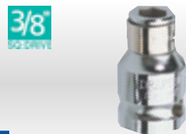
7 D-BH 3/8" Sq. Dr. Bit Holding Socket

Expert Quality , insert bit holder with spring clip and ball bearing for secure 1/4" bit holding. Forged from chrome vanadium steel hardened, tempered and chrome plated for corrosion resistance. Display packed.