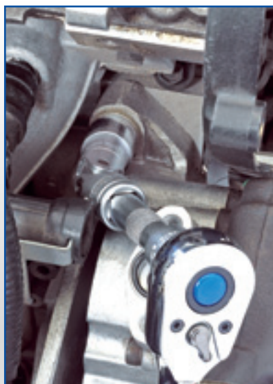
3 D76BS 3/8" Sq. Dr. Satin Chrome Universal Joint