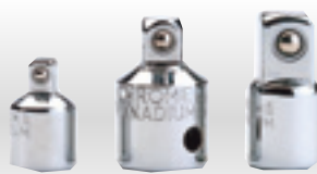
6 D67ABC 3 piece Socket Converter Set

Manufactured and tested generally in accordance with DIN3122 and ISO3315 Specifications Expert Quality , manufactured from chrome vanadium steel hardened, tempered, chrome plated and polished for corrosion protection. Display packed. Sizes: one each of 3/8" (F) x 1/4" (M), 1/2" (F) x 3/8" (M) and 3/8" (F) x 1/2" (M)