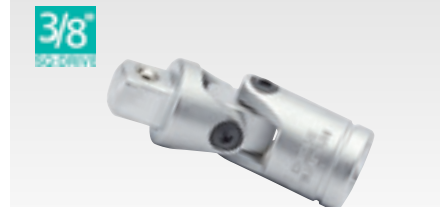
3 D76BS 3/8" Sq. Dr. Satin Chrome Universal Joint

Manufactured and tested generally in accordance with DIN3122 and ISO3315 Specifications Expert Quality , manufactured from chrome vanadium steel hardened, tempered and satin chrome plated. Head swings through 90° in both directions. Screwed allows longer working life. Sold loose.