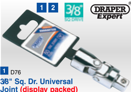
1 D76 3/8" Sq. Dr. Universal Joint (display packed)

Manufactured and tested generally in accordance with DIN3122 and ISO3315 Specifications Expert Quality , manufactured from chrome vanadium steel hardened, tempered, chrome plated and polished for corrosion protection. Head swings through 90° in both directions. Spring-loaded ball bearing for secure socket holding. Display packed.