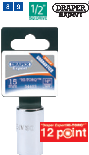
8 H-MM 1/2" Sq. Dr. Draper Expert Hi-Torq® Metric Sockets (display packed)

Manufactured and tested generally in accordance with DIN3122 and ISO3315 Specifications Expert Quality , 12 point sockets manufactured from chrome vanadium steel hardened, tempered, chrome plated and polished for corrosion protection. Chamfered end allows positive nut location. Display packed.