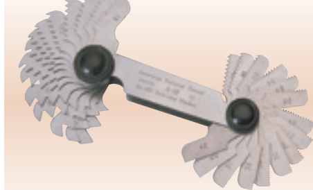
5 407 30 Blade UNC-UNF Screwpitch Gauge Set

Folding leaves, individually stamped with accurately formed thread profiles. American National Thread UNC-UNF, in the range 4-42TPI. Sold loose.