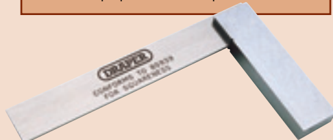
7 41 Engineers Precision Squares

Manufactured to BS 939 Workshop Grade B for squareness tolerance only.