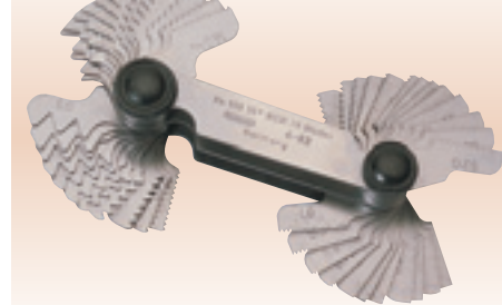
6 553 52 Blade BSW/Metric Screwpitch Gauge Set

Folding leaves, individually stamped with accurately formed thread profiles. Ranges 4-62BSW and 0.25-6.0mm. Sold loose.