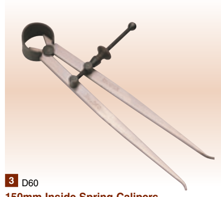
3 D60 150mm Inside Spring Calipers

Fine ground with adjustment by knurled wheel. Display packed.