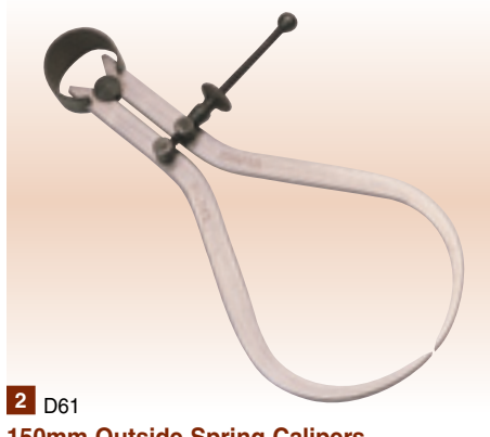
2 D61 150mm Outside Spring Calipers

Fine ground with adjustment by knurled wheel. Display packed.