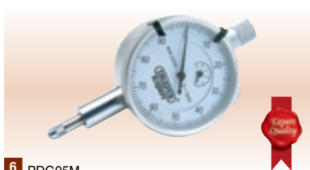
6 PDG05M Metric Dial Test Indicator

Expert Quality , reading 0-100 in metric graduations. Range 0-5mm. Dial diameter 41mm. Display carton.