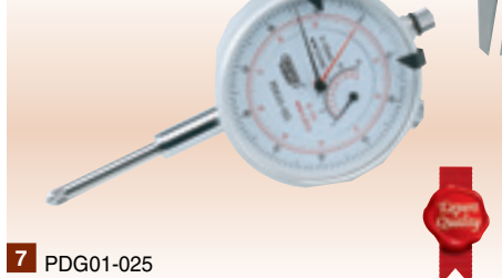
7 PDG01-025 Dual Reading Dial Test Indicator

Expert Quality , reading 0-100 in metric and imperial graduations. Graduations 0-25mm x 0.01mm and 0-1" x 0.001". Dia diameter 55mm with 8mm stem. Fitted with mounting lug. Display carton.