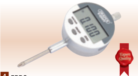
4 PDDG Dual Reading Digital Dial Test Indicator

Expert Quality , dial diameter 55mm with mounting lug. 0-25mm/0-1" travel. Uses CR2032 battery (supplied). Display packed in plastic storage case.