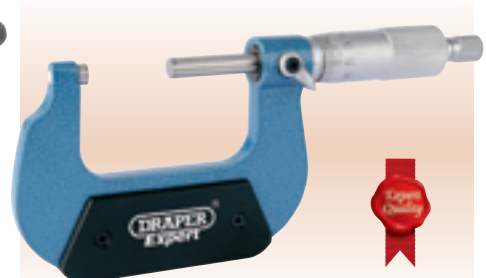
2 PEM Metric External Micrometers

Expert Quality , with enamelled frame, heat plates, satin chrome thimble and sleeve. Graduations 0.01mm. Carbide tipped anvils, lock and ratchet stop. Supplied in plastic storage case and display packed.