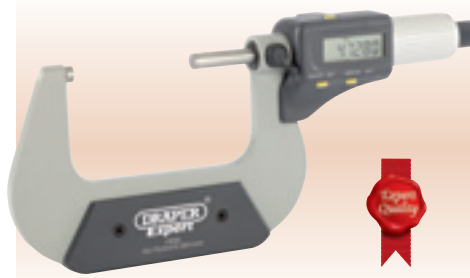
1 DEM Dual Reading Digital External Micrometers

Expert Quality , with enamelled frame, heat plates, satin chrome thimble and sleeve. Carbide tipped measuring anvils, lock and ratchet stop. Graduations 0.001mm and 0.0005". Ball end cap for measuring curved surfaces. Supplied with SR44 battery. Display packed in plastic storage case.