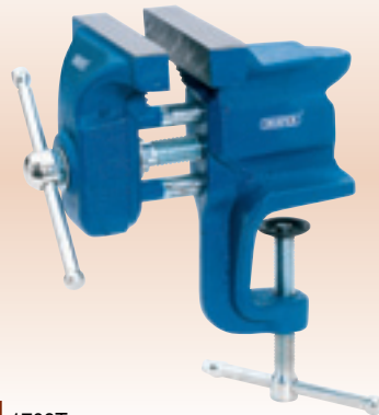
2 1709T 75mm Bench Vice

Cast iron with serrated curved jaws. Bench clamping screw 40mm capacity manufactured from zinc plated carbon steel. Display packed. Display carton.