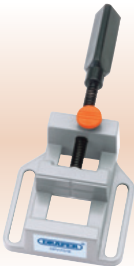
4 DPV70/B 'Quick Action' Drill Press Vice

Manufactured from cast aluminium with hardened jaws. 'Quick action' release at rear of vice allows jaws to be opened quickly. Display carton.