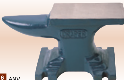
6 ANV 4.5kg Anvil

Single bick cast iron anvil, bolt down pattern. Grey cast iron. Oblong working surface 120 x 65mm. Display carton.