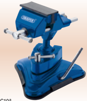
3 VAC10/L 75mm Vacuum Vice

Versatile swivel vice with powerful suction base which fixes to any smooth surface. Swivelling head allows many varied positions. V grooved jaws for holding cylindrical and irregular shapes. Supplied with removable soft rubber safety jaw covers. Display carton.