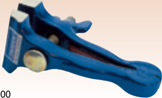
1 HV100 36mm Hand Vice

Hand held vice for the secure clamping of component parts prior to grinding, drilling, etc. Carton packed.