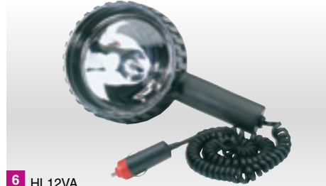
6 HL12VA 500,000 Candle Power 12V DC Halogen Lamp

Halogen spotlight with 110mm diameter lens for general applications in and around the car, boat and caravan etc. Supplied with 1M (unstretched) of flexible cable and vehicle cigarette lighter-type plug. Can be used with Draper Power Pack Stock No. 54723. Display carton.