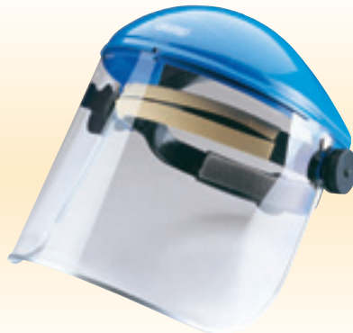
7 FS8 Faceshield

Clear polycarbonate. Providing a clear view with adjustable browguard, sweatband and harness. Display packed.