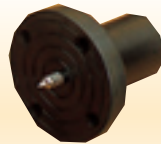
4 AWL3 Screw Chuck

Thread size: 3/4" x 16 TPI. For use with Draper Wood Lathes Stock No. 63938 and other manufacturers similar machines. Display packed.