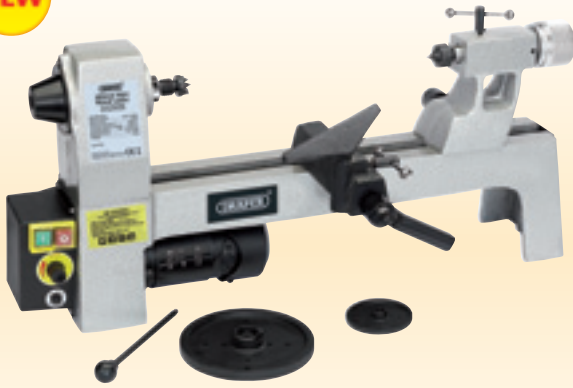
1 WTL330 250W 230V Variable Speed Mini Wood Lathe