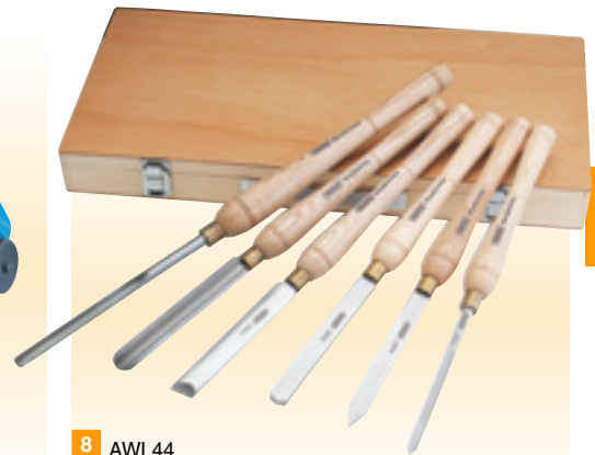
8 AWL44 6 piece HSS Woodturning Chisel Set

Hardened blades with brass ferrules. Ash handles. Packed in wooden storage box. Contents: • Bowl Gouge with 12.7mm (1/2") blade • Roughing Gouge with 25mm (1") blade • Oval Skew with 25mm (1") blade • Parting Tool with 5.5mm (7/32") blade • Round Nose Scraper with 25mm (1") blade • Spindle Gouge with 10mm (3/8") blade