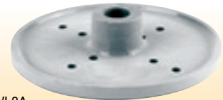
5 AWL8A 150mm Right Hand Thread Face Plate

Thread size 3/4" x 16 TPI. For use with Draper Wood Lathe Stock No. 63938 and other manufacturers similar machines. Display packed.