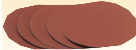
2 ADS305 305mm Sanding Discs

For use with Draper Disc Sander Stock No. 88912 and other manufacturers similar machines. Assorted pack comprises 1 x 60, 2 x 80, 1 x 100 and 1 x 120 grit grades.