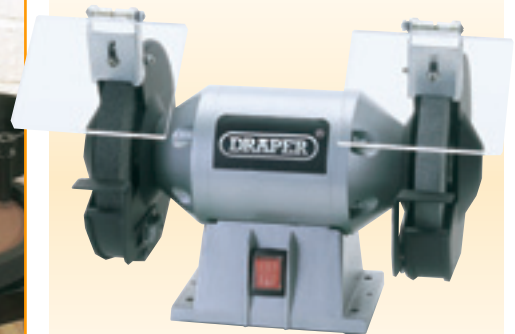
5 G150C 150mm 250W 230V Bench Grinder

A compact machine with one coarse and one fine grinding wheel, adjustable eye protection shields, spark deflectors, wheel guards and tool rests. Fitted with a BS approved non-rewireable 3 pin moulded plug and cable. Display carton.