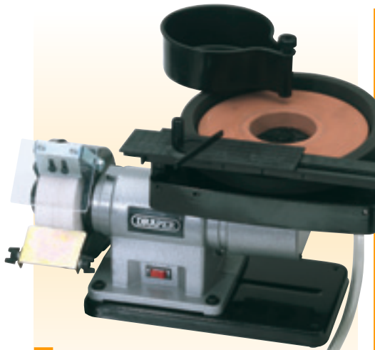
4 GWD205A 350W 230V Wet & Dry Bench Grinder

Designed for the workshop to hone and grind hand and garden tools. With a horizontal whetstone honing wheel, dry white grinding wheel, eye protection shield, spark deflectors, wheel guards and adjustable tool rests. Uses white dry grinding wheel especially suitable for high speed steel tooling. Fitted with a BS approved non-rewireable 3 pin moulded plug and cable. Display carton.