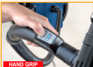
HAND GRIP WITH REMOTE ON/OFF CONTROL AND 7M OF HOSE