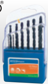
4 DS13I 13 piece Imperial HSS Twist Drill Set

Manufactured to DIN 338 and ISO 235/1 Specifications Expert Quality , high speed steel straight shank twist drills. Display packed. Contents: 1/16, 5/64, 3/32, 7/64, 1/8, 9/64, 5/32, 11/64, 3/16, 13/64, 7/32, 15/64 and 1/4".