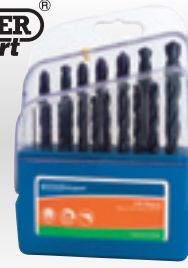
3 DS19M 19 piece Metric HSS Twist Drill Set

Manufactured to DIN 338 and ISO 235/1 Specifications Expert Quality , high speed steel straight shank twist drills. Display packed. Contents: 1.0, 1.5, 2.0, 2.5, 3.0, 3.5, 4.0, 4.5, 5.0, 5.5, 6.0, 6.5, 7.0, 7.5, 8.0, 8.5, 9.0, 9.5 and 10.0mm.