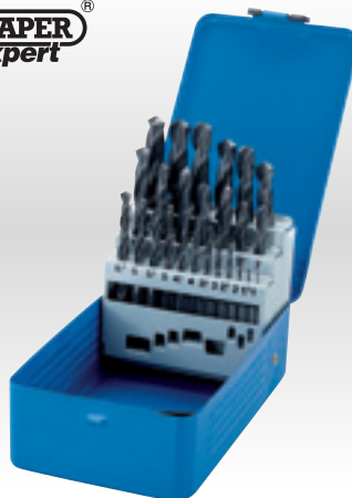
8 25HSS/S 25 piece Metric HSS Twist Drill Set

Manufactured to DIN 338 and ISO235/1 Specifications Specifications Expert Quality , high speed steel straight shank twist drills. Supplied in heavy gauge steel case. Display packed. Contents: 1.0, 1.5, 2.0, 2.5, 3.0, 3.5, 4.0, 4.5, 5.0, 5.5, 6.0, 6.5, 7.0, 7.5, 8.0, 8.5, 9.0, 9.5, 10.0, 10.5, 11.0, 11.5, 12.0, 12.5 and 13.0mm.