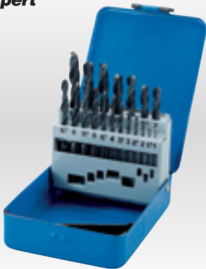
7 19HSS/S 19 piece Metric HSS Twist Drill Set

Manufactured to DIN 338 and ISO235/1 Specifications Specifications Expert Quality , high speed steel straight shank twist drills. Supplied in heavy gauge steel case. Display packed. Contents: 1.0, 1.5, 2.0, 2.5, 3.0, 3.5, 4.0, 4.5, 5.0, 5.5, 6.0, 6.5, 7.0, 7.5, 8.0, 8.5, 9.0, 9.5 and 10.0mm.