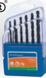
2 DS13M 13 piece Metric HSS Twist Drill Set

Manufactured to DIN 338 and ISO 235/1 Specifications Expert Quality , high speed steel straight shank twist drills. Display packed. Contents: 1.5, 2.0, 2.5, 3.0, 3.2, 3.5, 4.0, 4.2, 4.5, 5.0, 5.5, 6.0 and 6.5mm.