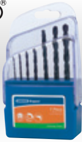
1 DS7M 7 piece Metric HSS Twist Drill Set

Manufactured to DIN 338 and ISO 235/1 Specifications Expert Quality , high speed steel straight shank twist drills. Display packed. Contents: 1.5, 2.0, 3.0, 4.0, 5.0, 6.0 and 6.5mm.