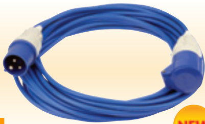
1 NEW 230V Extension Cables, Plugs and Sockets for Portable Transformers

14M (approx.) long with 16A plug and 16A socket to BS4343. Spare plugs and sockets are available separately. Packed in polythene bag.