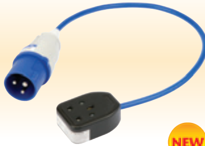
2 NEW 240VFL 230V 16A to 13A Adaptor Lead

Ideal for powering 13A appliances from a 16A three pin plug. Packed in polythene bag.