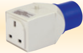
3 NEW 240VMP 230V 13A to 16A Moulded Adaptor

13A socket with 16A plug. Packed in polythene bag.