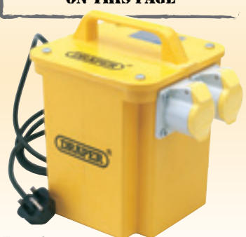
9 DPT3300/2 3.3kVA 230V Portable Site Transformer

Complies to BS3535, EN60742: 1996 and IP44