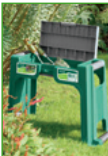
COMPARTMENT UNDER SEAT TO STORE HAND TOOLS