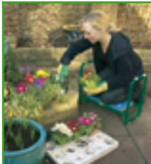
USE AS A KNEELER