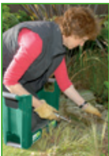
TURN UPSIDE DOWN AND USE AS A KNEELER