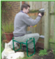
USE AS A SEAT