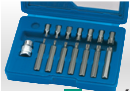
5 TX15/SET 1/2" Sq. Dr. Draper TX-STAR Bit Set

Draper TX-STAR products are compatible with †Torx fixing systems