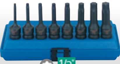
2 410/8/TX 8 piece 1/2" Sq. Dr. Impact Draper TX-STAR Socket Bit Set

Draper TX-STAR products are compatible with †Torx fixing systems