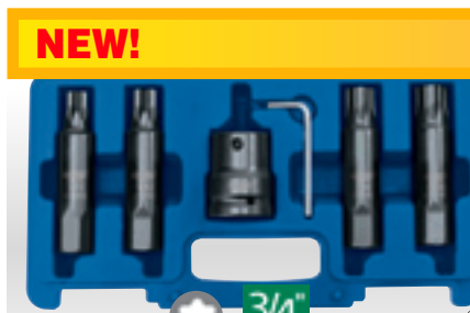
4 ITS6 6 piece 3/4" Sq. Dr. Impact Socket and Draper TX-STAR Bits Set

Draper TX-STAR products are compatible with †Torx fixing systems