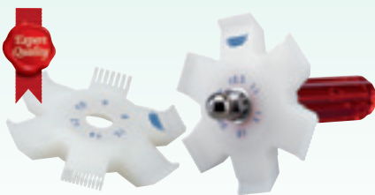
2 RFS1 Radiator Comb/Cleaner Kit

Expert Quality , for use in the maintenance of automotive radiators and air conditioning/refrigeration grille fins to obtain maximum performance. 12 plastic combs (six per attachment) will clear debris from radiator fin matrixes as well as reshaping damaged or bent grille fins. Comb attachments fix to plastic handle with ball end nut. Display packed.