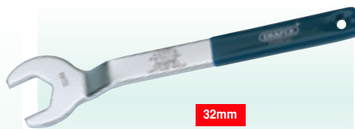
4 FHW32 32mm Thermo-Viscous Fan Nut Wrench

Every effort has been made to ensure that the applications shown in the 2010/11 Draper Tools Catalogue are accurate and include all the current car/van models. When using specialized automotive tools ALWAYS refer to the vehicle manufacturer's service or relevant Haynes manual for detailed and concise instruction of usage.