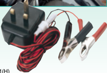
2 BM1(H) 12V Battery Master

Designed to be left connected to automotive-type batteries for extended periods of time. It will maintain the battery in a charged ready-to-go state, ensuring, for example, that a vehicle's alarm current does not drain the battery. Fitted with crocodile clips, in-line fuse and 4M of cable. Display packed.