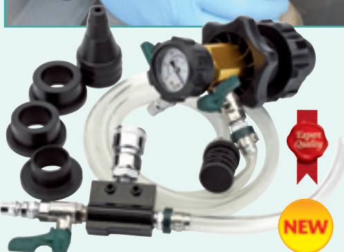
7 CAV1 Universal Cooling System Vacuum Purge and Refill Kit

Expert Quality , reduces cooling system refill time without introducing air-locks thus avoiding time-consuming cooling system bleeding. Plugs into air line then attaches to the cooling system to create a vacuum. Filler hose is then connected allowing pre-mixed coolant to flow easily into the system. Supplied complete with gauge, 1.3M of clear hose, four adaptors and hose end filler. Packed in carrying case with display label.