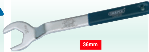
3 FHW36 36mm Thermo-Viscous Fan Nut Wrench

Manufactured from pressed steel hardened, tempered and chrome plated with PVC dipped handle. For the removal of thermo-viscous fans fitted to Ford and GM (Vauxhall/Opel) vehicles. Display packed.